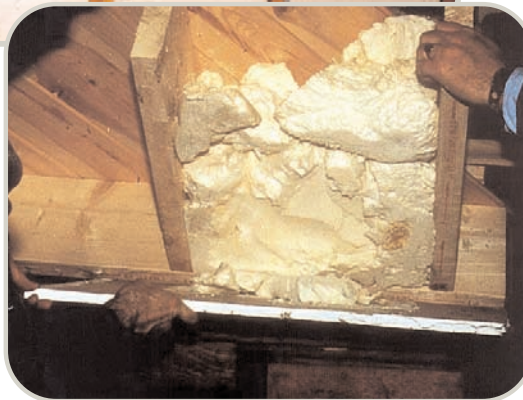
Images of UFFI above courtesy of Carson Dunlop. Copyright 2003, Carson, Dunlop & Associates Ltd.