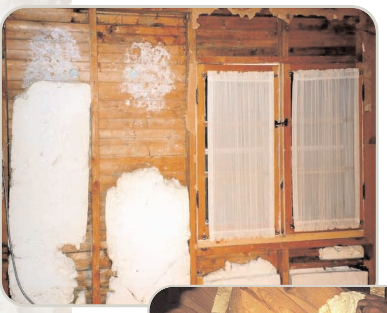
Images of UFFI above courtesy of Carson Dunlop. Copyright 2003, Carson, Dunlop & Associates Ltd.

properly. According to the federal government, there are no concerns about vermiculite causing damage to a house. It is estimated that between 200,000 to 300,000 homes had vermiculite insulation installed, but there is no estimate as to how many of those homes were insulated with Zonolite®.